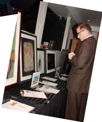
Browsing at the Silent Auction