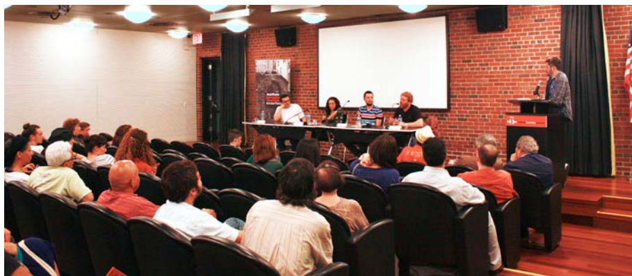
Our new partner Instituto Cervantes hosted a panel that addressed screenwriting, history and social memory in Latin American cinema