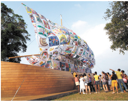
The pictures on the sails of the Ship of Tolerance were painted by Cuban children.

The Ludwig Foundation of Cuba and AFLFC assisted the internationally renowned, Russian-American artists, Ilya and Emilia Kabakov with producing their Ship of Tolerance at the 11th Havana Biennial. This project brought exchanges between American, Russian and Cuban teen-agers with exceptional musical skills whose magnificent performance in a historic church in Old Havana represented an important moment in cultural diplomacy.