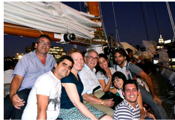
Taking in all the sights on the Hudson River while sailing on the schooner, America.

Six staff members of the Ludwig Foundation of Cuba traveled to the U.S. to participate in cultural exchange programs. A program coordinator, a computer engineer and a lawyer interned at the Grand Circle Foundation in Boston. A photographer and public relation specialist lived with families and studied English in Burlington, VT. Another staff member joined the group on their visit to New York City where they were personally received by curators and staff members of NY's cultural institutions and museums including BAM, MoMA, PS. 1, The Whitney Museum of American Art, Guggenheim Museum, Frick Museum, Natural History Museum, Bronx Museum of the Arts, Museum of the Moving Image and The NY Public Library. They went to a Mets game, saw a play on Broadway, visited the artists Ilya and Emilia Kabakov, went to Coney Island, reconnected with students and professors at Tisch School of the Arts who have studied at the Ludwig Foundation of Cuba. This experience enhanced their English language skills, developed new contacts and expanded their cultural and professional exposure.